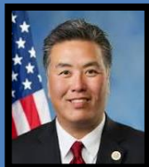
Congressman Mark Takano