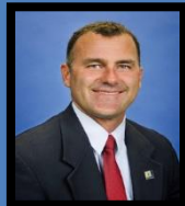
Mayor of Riverside Rusty Bailey